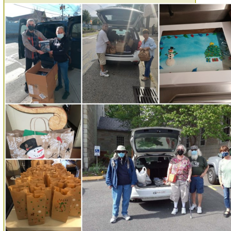
Above: A photo collage of NSJC volunteers and their projects in 2022-23.