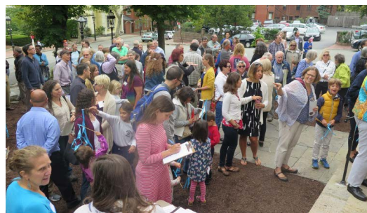
The congregation gathered in front of the Meeting House before the first service of the new church year.

Please help our new photo library continue to grow. Overwhelm us! Please send your photos to FirstUYearInPhotos@gmail.com . The photos will go into our new photo library and may be used in our publications and other communications. Thank you in advance.