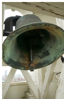
Our Paul Revere bell is rung every Sunday to welcome worshippers.