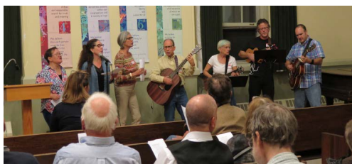
The Community Band serenaded participants at the opening Parish House Supper..